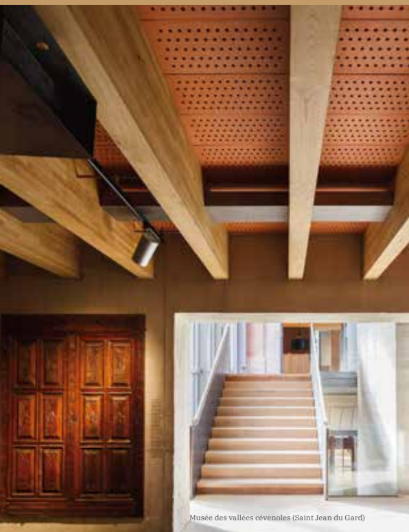
Musée des vallées cévenoles (Saint Jean du Gard)