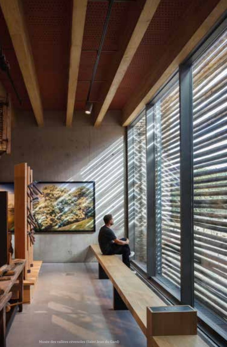
Musée des vallées cévenoles (Saint Jean du Gard)