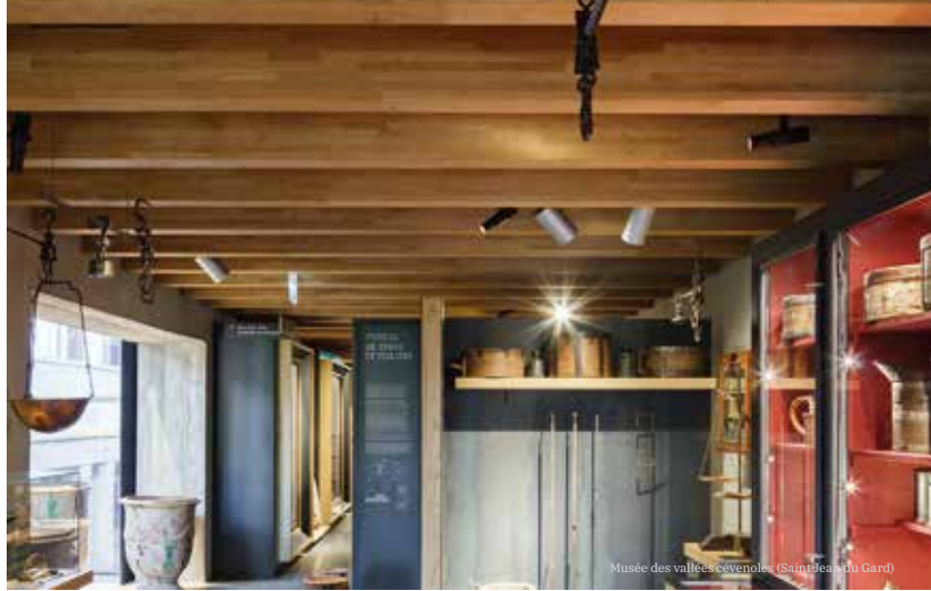
Musée des vallées cévenoles (Saint Jean du Gard)